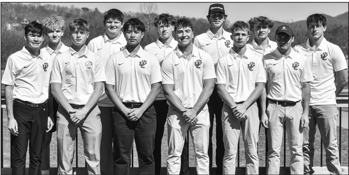
The Union County boys golf team will compete for a State Championship in Columbus on May 19-20.